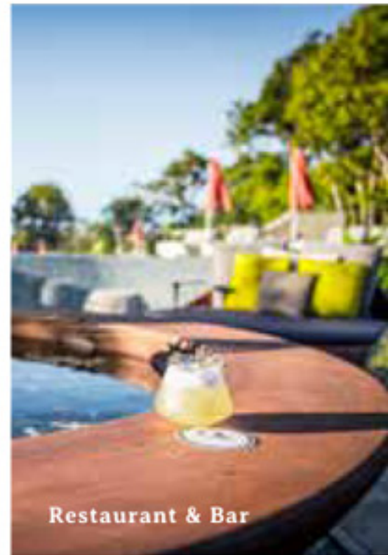
Restaurant & Bar